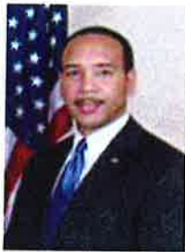
Ruben Diaz Jr. BOROUGH PRESIDENT